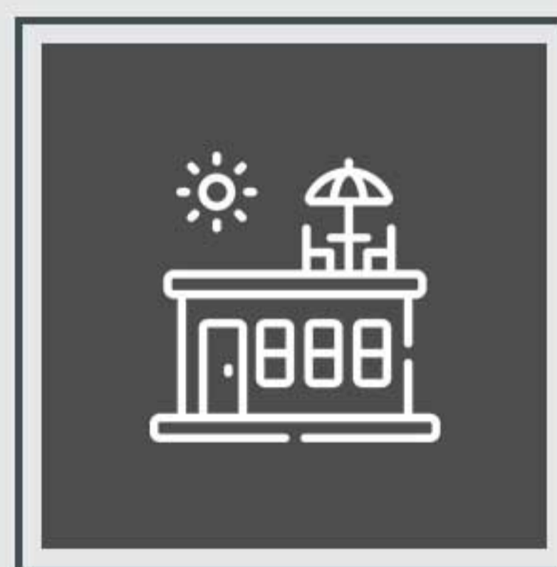
Rooftop Sitting Area