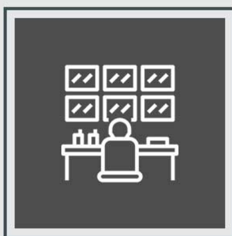
24/7 Security & Surveillance